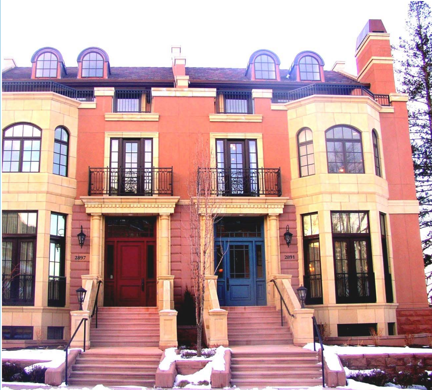
Broadmoor Brownstones